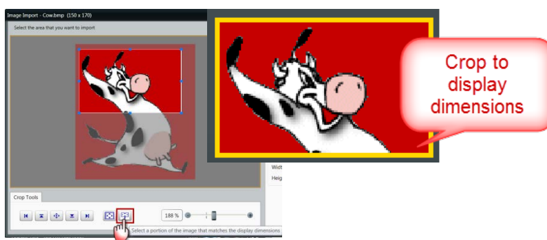
Figure 1: Drag handles to crop selected area or use the tool to select a portion of the image that matches the display dimensions and reposition the box