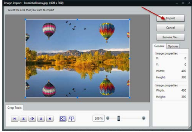
Figure 3: Import the graphic into Content Studio.