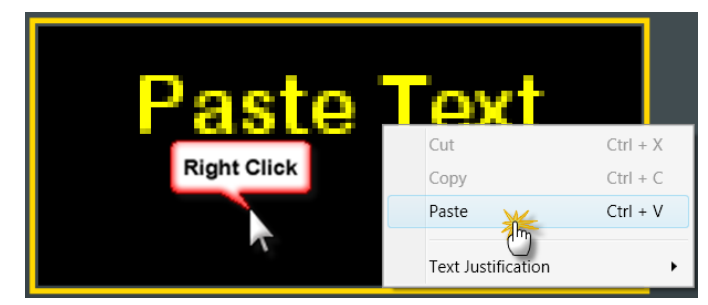
Figure 3: Pasting Text