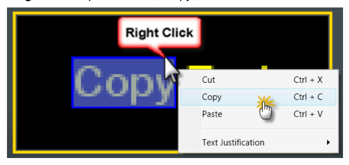
Figure 1b: Select, right click, Copy